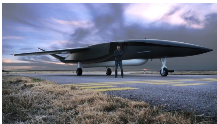
The 28 ton Aevum RavnX, World's largest UAV

When posterity looks back on the history of aviation the advent of the unmanned aircraft will rank alongside the Wright brother's flight at Kitty Hawk and Frank Whittle's invention of the turbojet. As with all new innovations come opportunities for those with the foresight to grasp them.