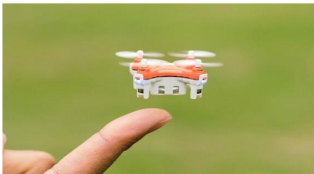
The Buzzbee nano-drone, World's smallest drone available commercially for £19.99

The range of unmanned aircraft that have come to the market in the last ten years has seen an explosion in the type of designs available and the scope of applications for which they have been employed.